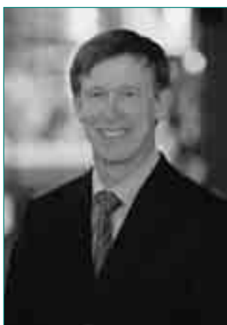
Denver Mayor John Hickenlooper

The conference offers eight broad subject tracks and 64 workshops covering the major issues facing the low income energy assistance community. Conference goers will have many opportunities to interact with their peers from around the country as well to participate in meaningful and informative discussions.